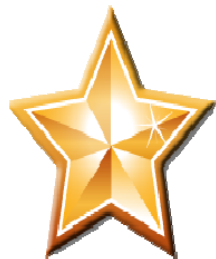
Science Fair Category Award Winners