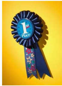
Science Fair 1st Place Winners