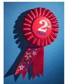
Science Fair 2nd Place Winners